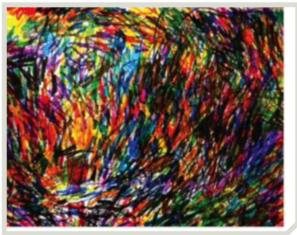
Figure 7: Arrian worked on this 18" x 24" painting for five days, using Crayola markers, at age 2 years 3 months

at the outset of this article, along with realistic skill, five other factors are likely to be predictive of becoming an artist: (1) the child's drawings have interesting, arresting compositions; (2) the child's drawings have decorative, aesthetic features and/or expressive power; (3) the child shows a hunger to look at art (whether in museums or books), and hence a deep interest in art; (4) the child has enormous drive – a rage to master; and finally, and perhaps most importantly, (5) the child has a desire not just to make excellent art, but to be original, innovative, new.