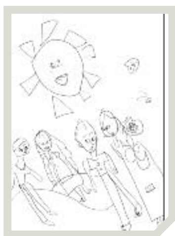
Figure 2: Kai, age 3 years 9 months

Realistic drawing skill is strongly associated with the use of a superior local processing style (focusing on the parts on a visual display). We administered a version of the Block Design Task once in traditional format, and once with the blocks segmented in space from one another, making it easier to copy the designs with actual blocks. While typical children were helped by presentation of the task in segmented form, since the segmentation reveals each part (or segment) of the design to be reproduced with blocks, precocious realists benefited less from this external segmentation, presumably because they were able mentally to segment a complex form into its parts. The precocious realists also outperformed typical drawers in the ability to detect small shapes hidden within complex figures – a task requiring a kind of analysis of a form into its parts.