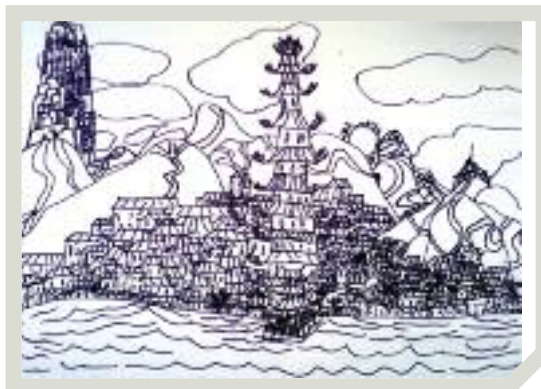
Figure 1: Reese, age 5 years 5 months

Some children are able to create stunningly realistic drawings at a young age without having ever taken drawing lessons. Figure 1 shows a drawing created by Reese at age 5 years 5 months and shows occlusion, detail and fluid movement. Figure 2 shows a drawing created by Kai at age 3 years 9 months that shows figures in motion and interacting with their eyes. Most adults cannot draw nearly as realistically as these