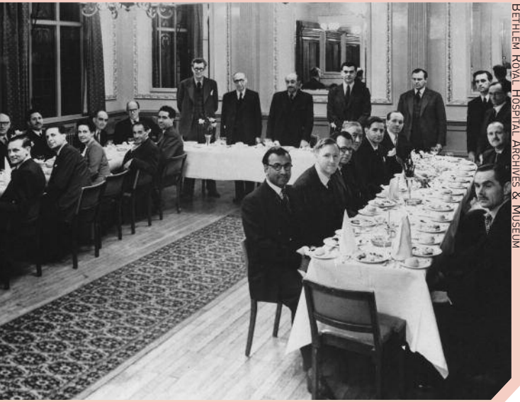
BETHLEM ROYAL HOSPITAL ARCHIVES &amp; MUSEUM

grammar school system; ignoring intelligence differences when accounting for the existence of social class; sex differences in personality and intelligence; and so on). Eysenck's lack of recognition in the Honours List – which he might have expected for his outstanding contribution to British psychology – stands as a warning to those who hope for a token of public recognition, that meddling in 'controversial' areas is a little more than frowned upon in the world of political patronage.